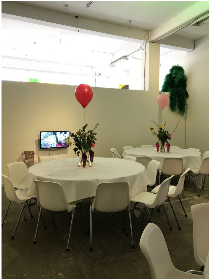
Beeld: Verjaardagsdiner in Roodkapje

Roodkapje has a P.A. with microphones, stands and a DJ set. A beamer and multiple screens are also available. We do not have a backline (amps, instruments).