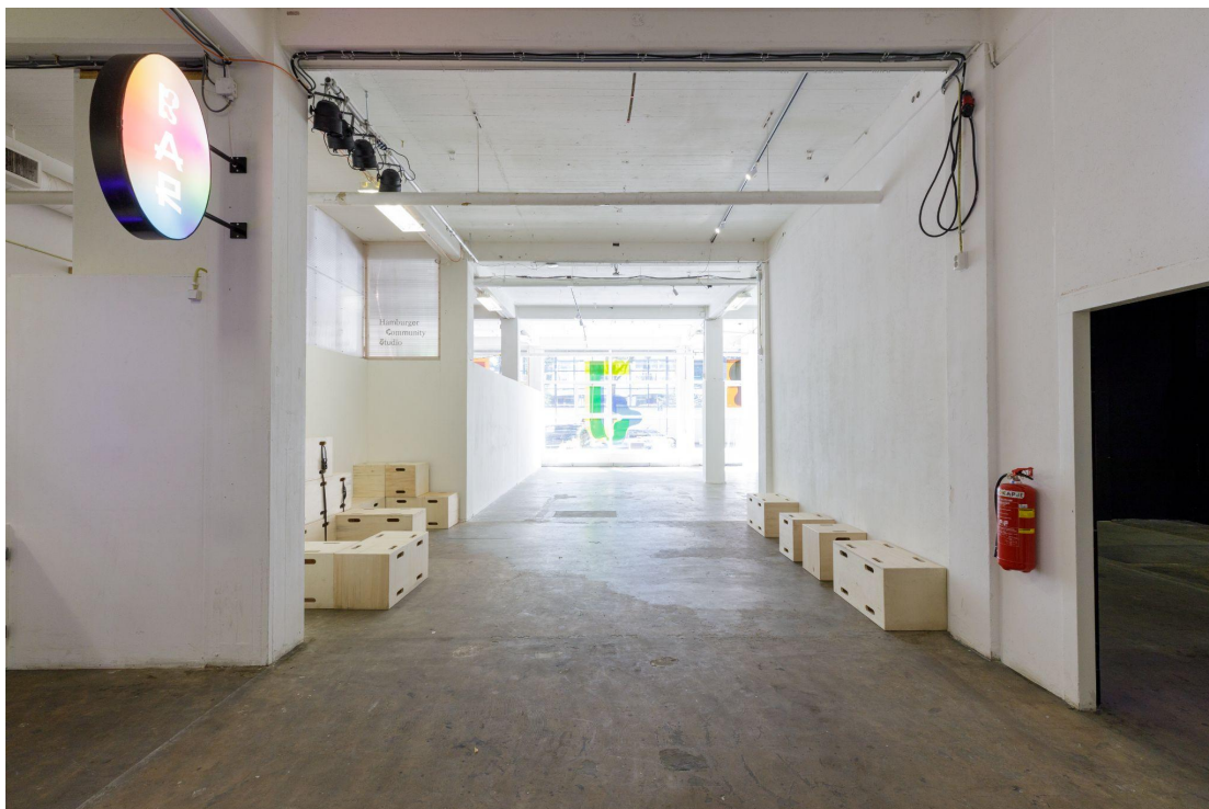
Exhibition space