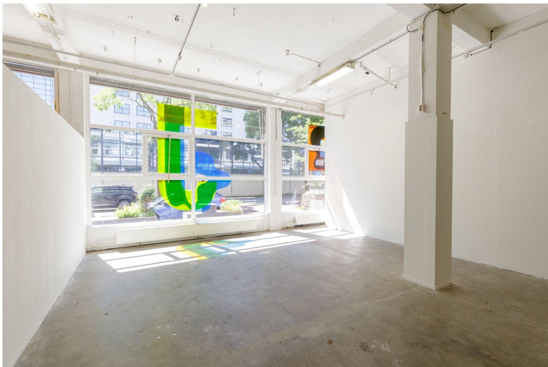
Exhibition space