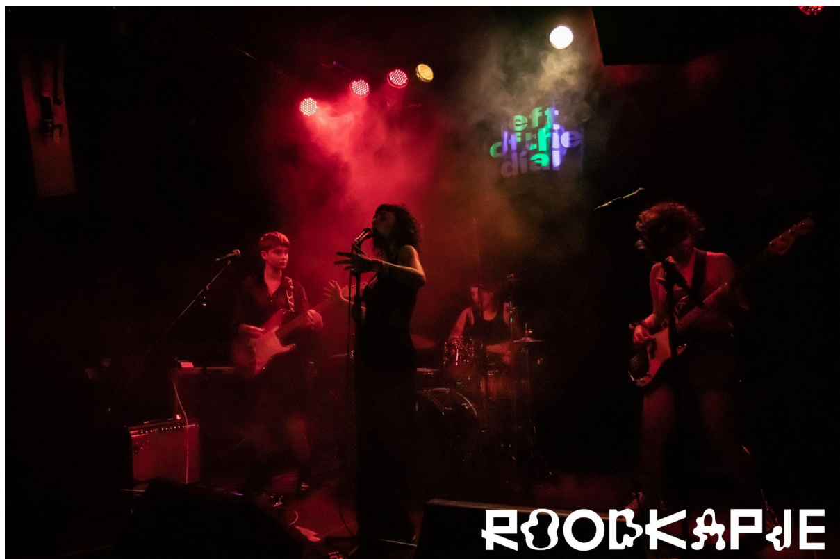
Showcase festival Left of The Dial at Roodkapje, image Diana Putavet

Roodkapje is the ideal spot for an EP release, party or a lecture with an open bar.