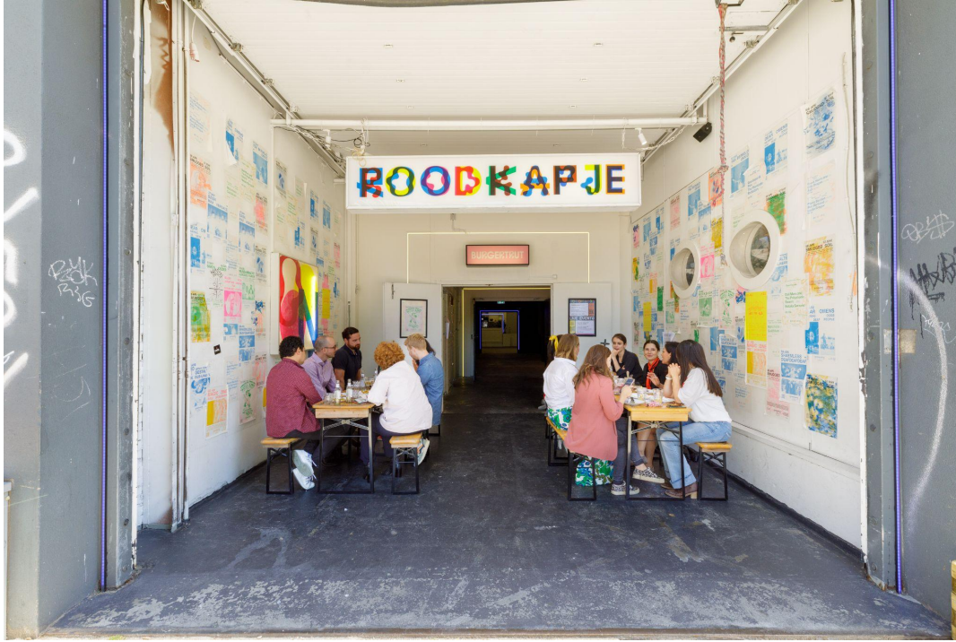
"De Garage"

Below an overview of the different spaces of Roodkapje.