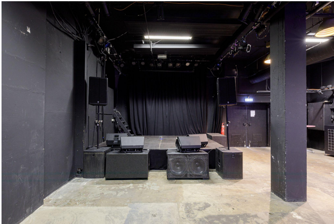
Stage in the SUB