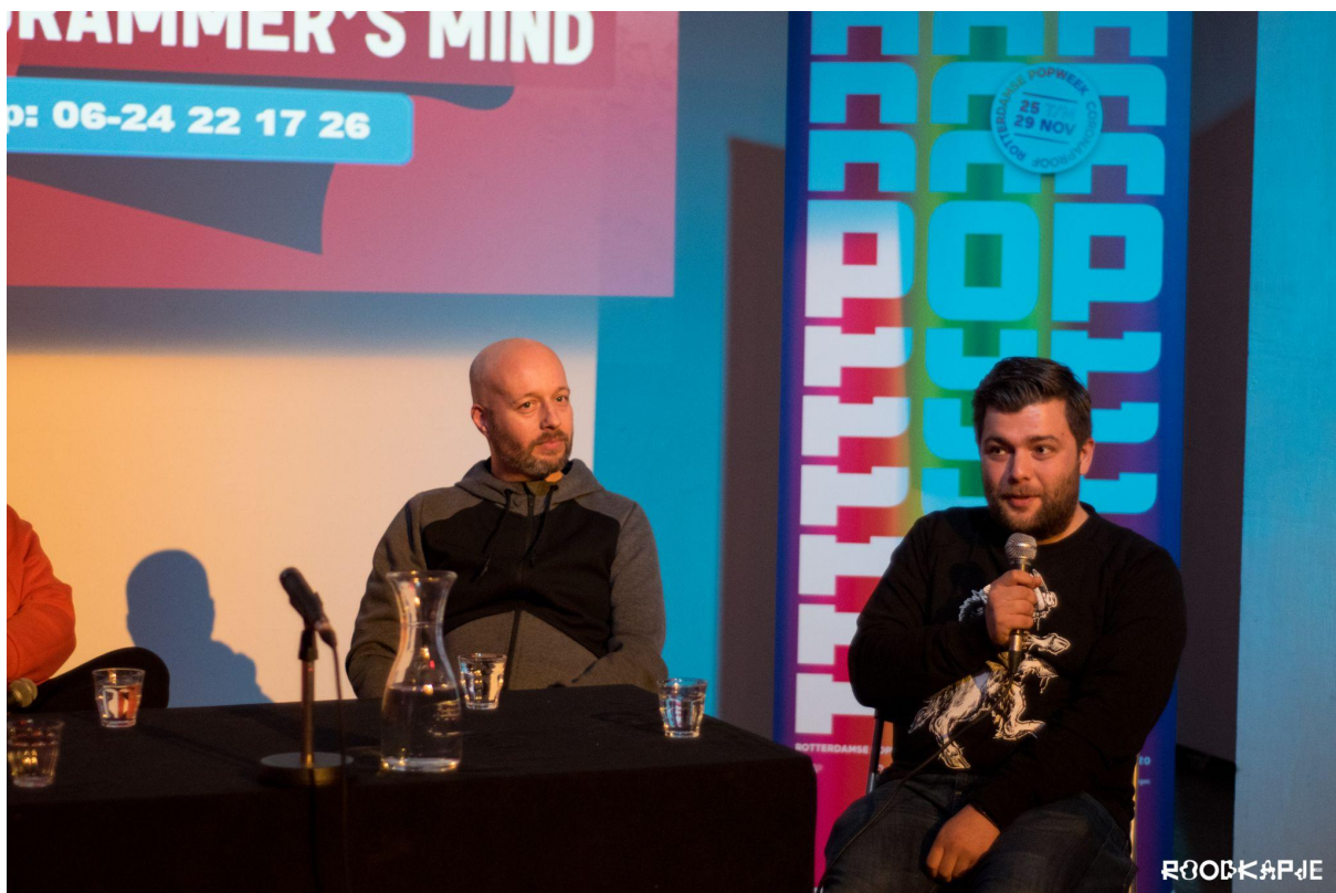
Meet The Pro Conference from de Popunie at Roodkapje