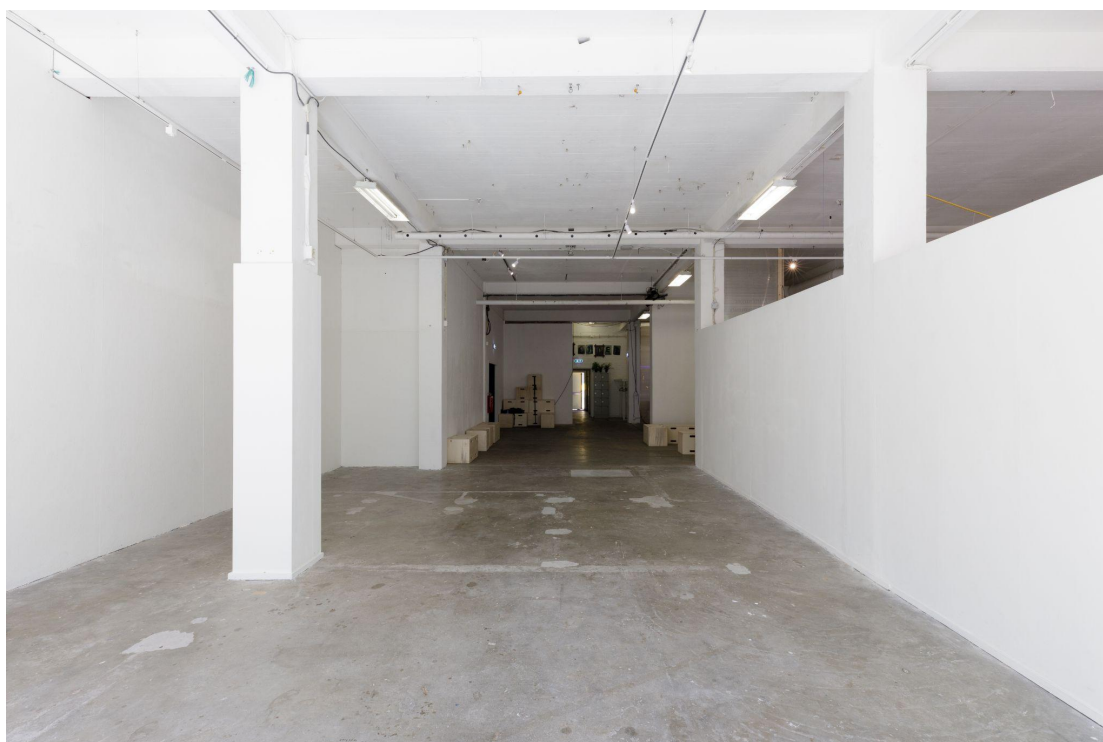
Exhibition space