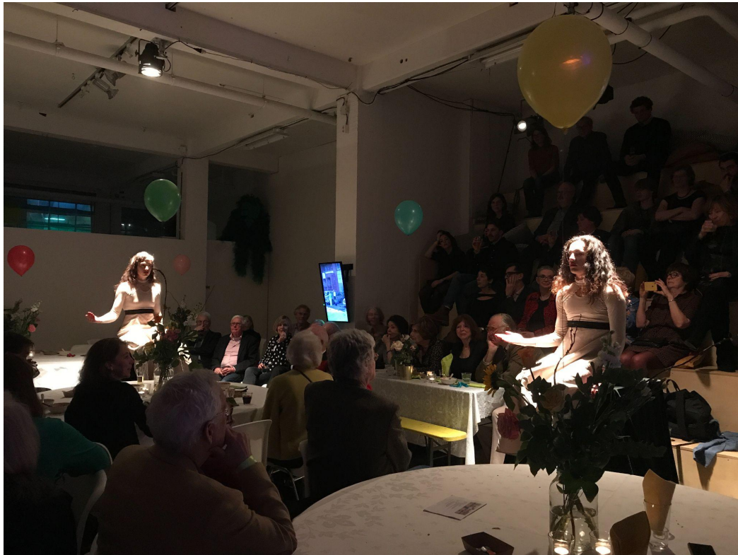
Performance at a Birthday Party in Roodkapje

Roodkapje is situated in an old anti-squat building without a possibility to create a toilet for wheelchairs. The event space is on ground level and directly accessible from the street. Burgertrut restaurant is surrounded by stairs, but we have a ramp that we can attach to the stairs when needed.