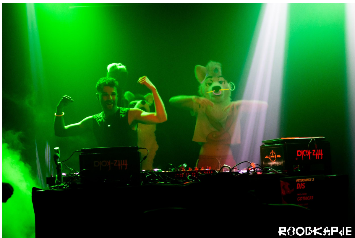
Otterdance at Roodkapje

Roodkapje Rotterdam Delftseplein 39 3013AA Rotterdam