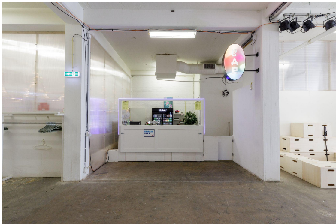
Bar Roodkapje