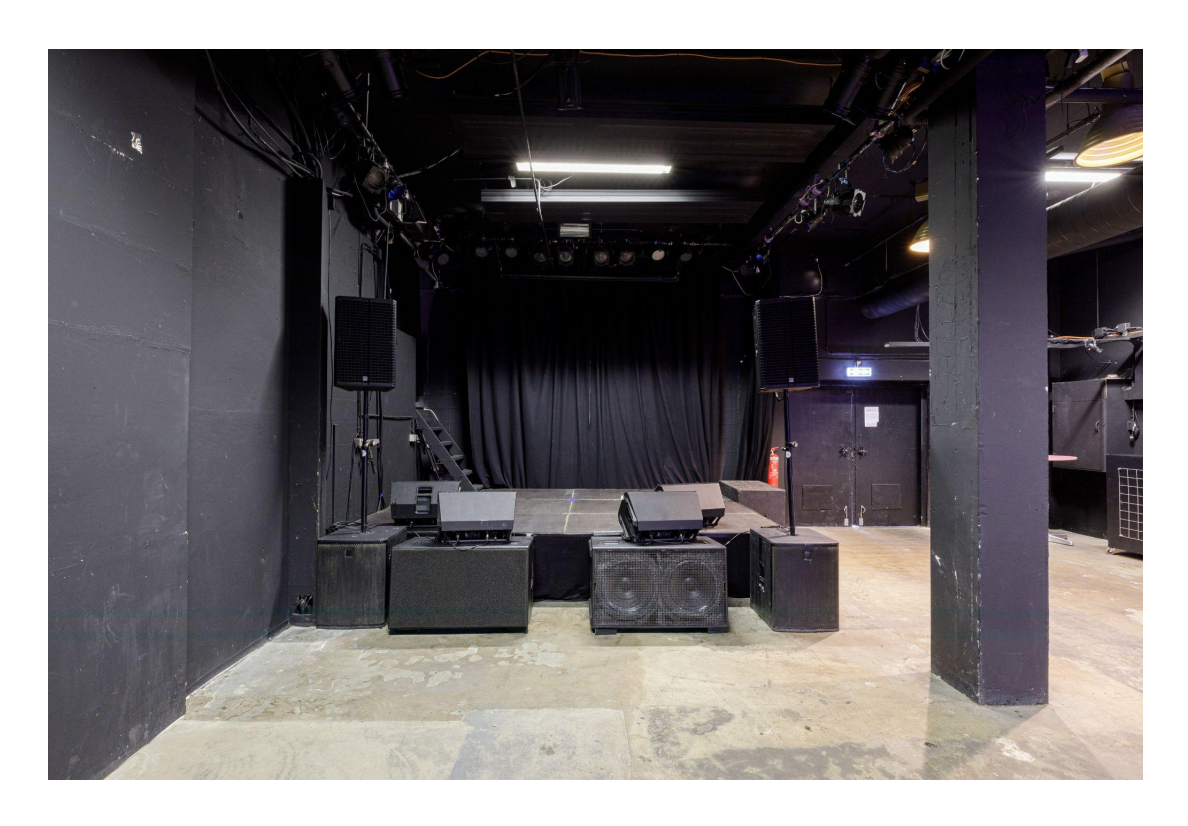
Front view stage