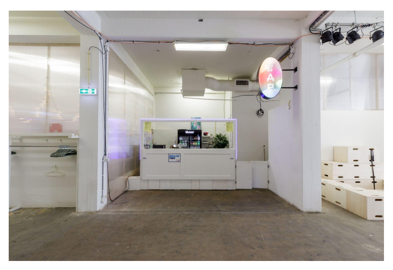
Bar Roodkapje, image Luuk Smits