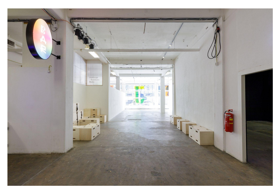
Exhibition space, image Luuk Smits