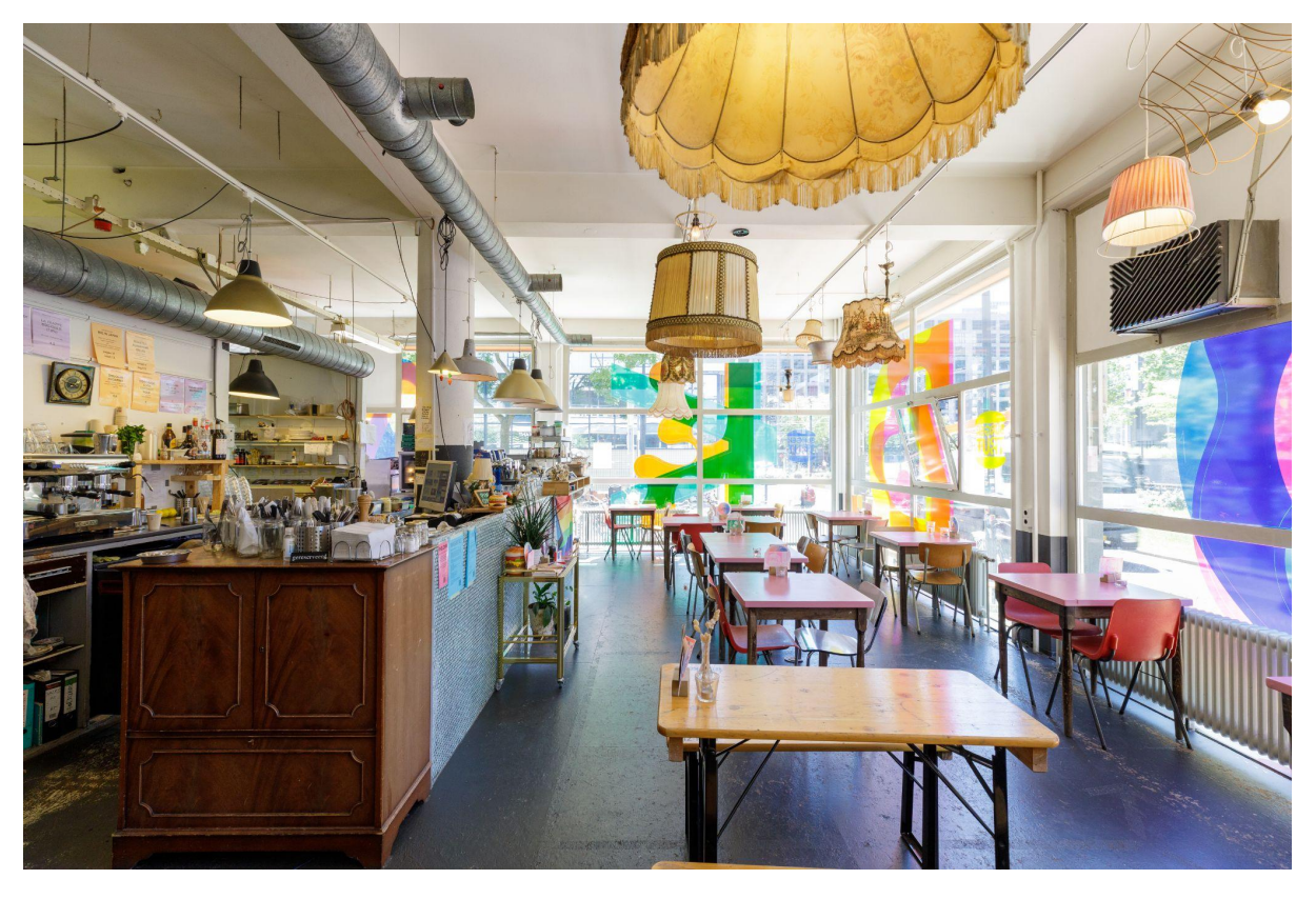
De Burgertrut