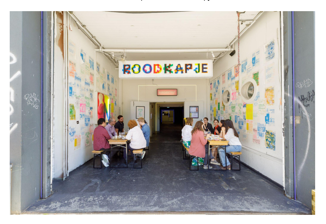
Entrance Roodkapje, image Luuk Smits

Below an overview of the different spaces of Roodkapje.