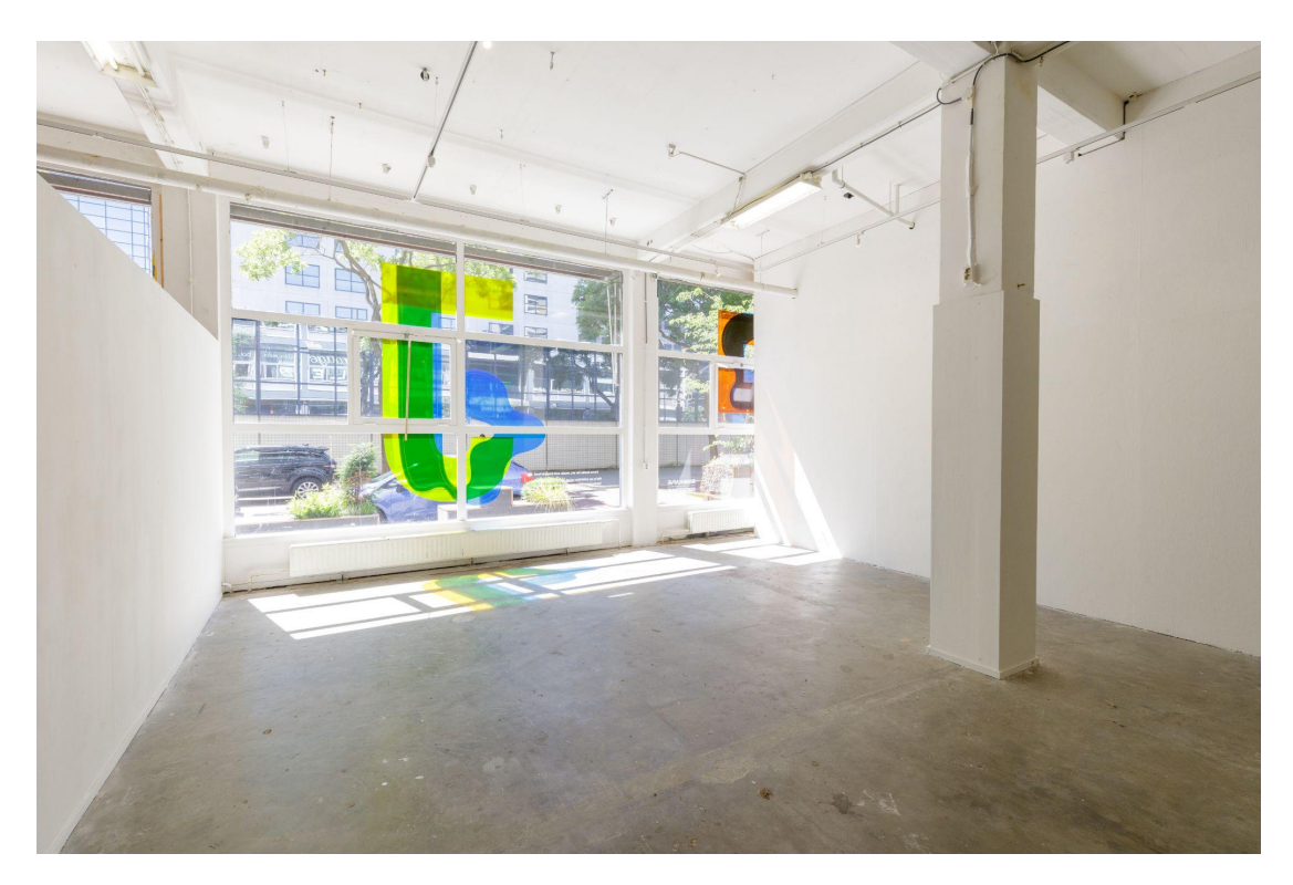
Exhibition space, image Luuk Smits